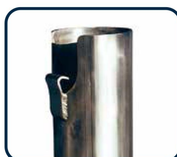
Pipe Flare with Gas Stripper