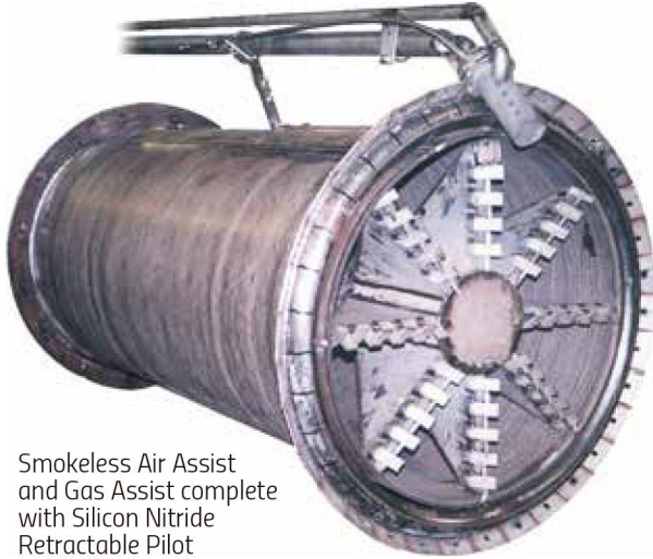
Smokeless Air Assist and Gas Assist complete with Silicon Nitride Retractable Pilot

Flare and Vapor Smokeless Flare Tip assemblies are designed to convert a smoking stack to smokeless. The principle operation of the units are based on using force to mix oxygen with the flare gas thus enhancing the burning efficiency of the hydrocarbon molecules. These air assist packages can be adapted to existing stacks that are in the field or to new ones being manufactured. So, if your stack is smoking and you would like to be more environmentally friendly, please give us a call and we will calculate the size of the unit that you require.