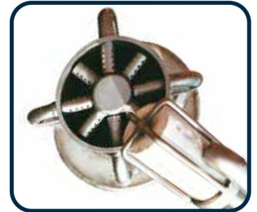
Multi Flow Air Assist