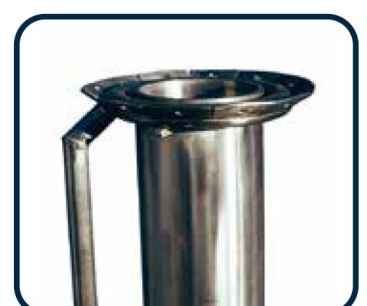
Ring Burner Gas Assist