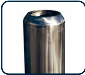
Purge Reducing Tip - Cut Purge Rates and Burn Smokeless at Low Rates