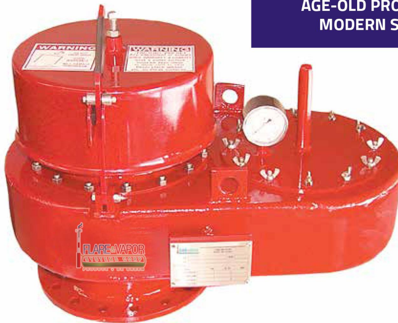
Right Side Up Thief Hatch

FAV SYSTEMS INC. CONVERTS AGE-OLD PROBLEMS INTO MODERN SOLUTIONS