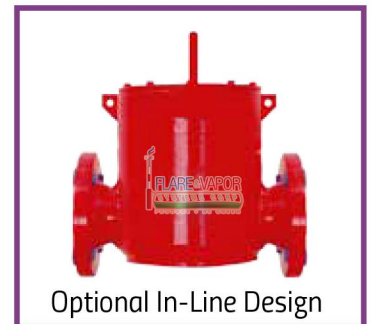
Optional In-Line Design