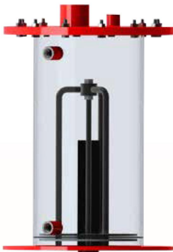
Interior Layout of Flutter Fixer