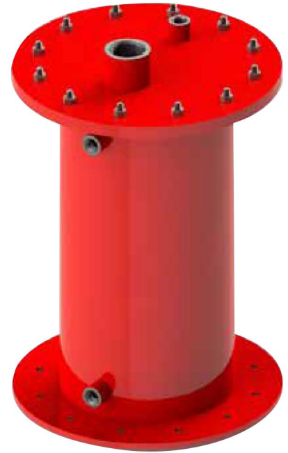
FAV System Flutter Fixer

With the spring system, the pressure rises the pallet, but when the pressure is released the pallet falls down, and this is repeated dozens of times in a day causing damage to the sealant on the pallet and breaking it. Here is where the Flutter Fixer comes to scene. When the pressure increases, the pallet moves upward slowly because of the weights and the liquid filled camera that acts as impact absorber and when the pressure is released slowly puts down the pallet.