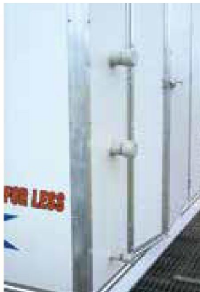
20 minute hookup for suction, discharge & drainage