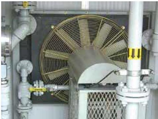
Efficient Cooling System